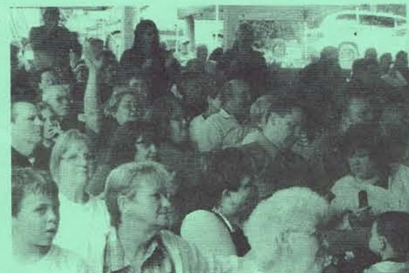
Portion of the Saturday Afternoon Crowd

If you are interested in taking part in the Pines as a singer, musician, or volunteer, Please call.